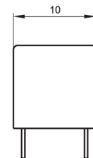
Wiring Diagram(Bottom view)